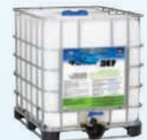
275 Gallon Tote † Part# DEF275P (Plastic Valve) DEF275S (Stainless Steel Valve)

†ALSO AVAILABLE IN 330 GALLON TOTE AND IN BULK.