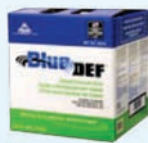
2.5 Gallon Part# DEF002